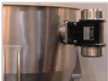
MARTIN® XHA Series Extra Hi-Amplitude Electric Vibrator