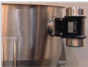
MARTIN® XHA Series Extra Hi-Amplitude Electric Vibrator