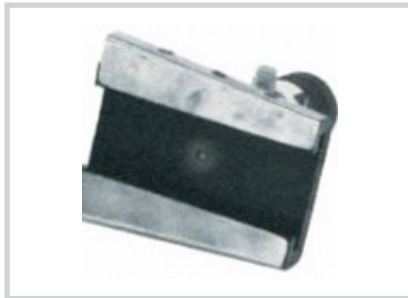
MARTIN® WEDGIE™ Portable Vibrator Mounting System