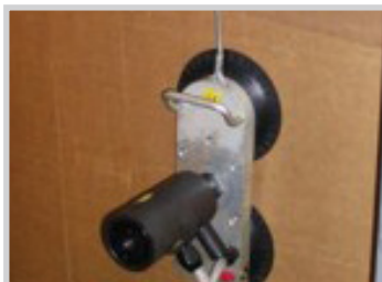
MARTIN® VAC-MOUNT™ Portable Vibrators