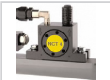
MARTIN® VAC-MOUNT™ Portable Vibrators