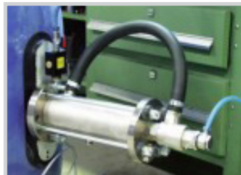
MARTIN® VAC-MOUNT™ Vibrators are perfect for troubleshooting material flow problems.