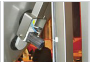
Great for unloading, compaction, cleaning, and testing.