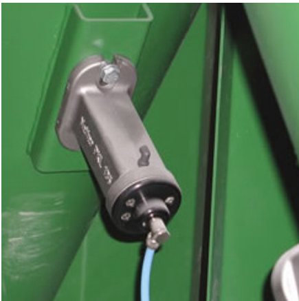
PKL 135 Impactor mounted on cone.