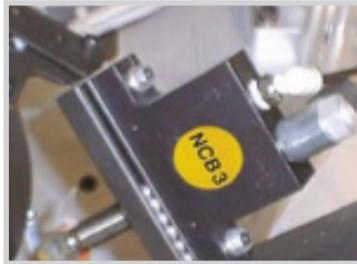
Sanitary coating - perfect for food and pharmaceutical applications.