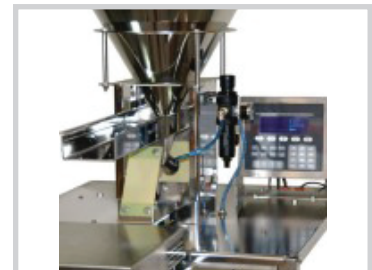
MARTIN® E-Z™ Weigh-Feeder/Hopper System