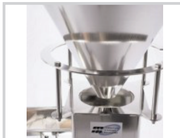
MARTIN® E-Z™ Weigh-Feeder/Hopper System