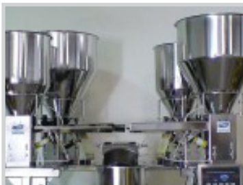
MARTIN® E-Z™ Weigh-Feeder/Hopper System