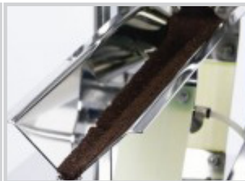
MARTIN® E-Z™ Feeder