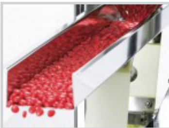
MARTIN® E-Z™ Feeder