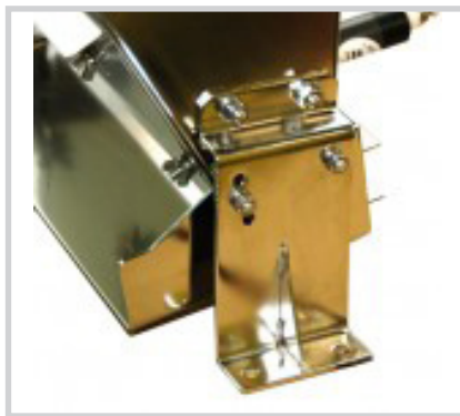
MARTIN® E-Z™ Dry Ingredient Spreader