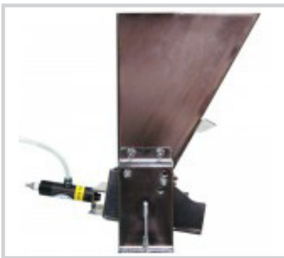
MARTIN® E-Z™ Dry Ingredient Spreader